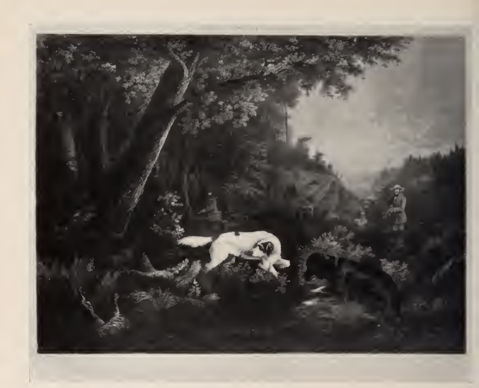
PARTRIDGE SHOOTING [NUMBER 292]